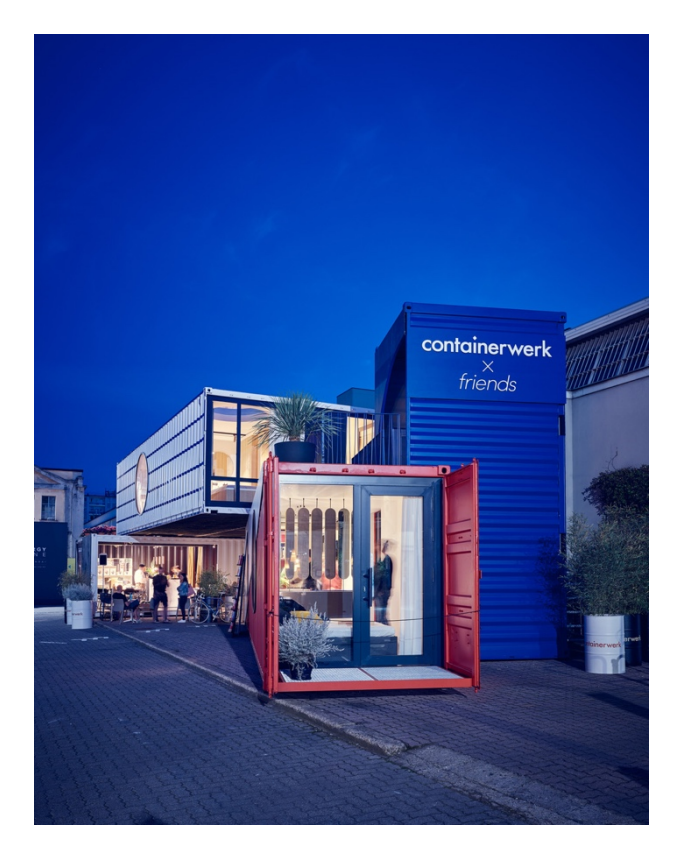
Bild: PM_Containerwerk_30.000 begeisterte Besucher – Containerwerk überzeugt auf der Milan Design Week 2018 _Bild 2

BU: Containerwerk & Friends installation