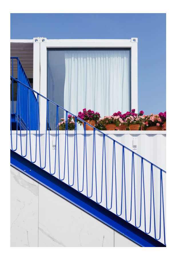
Bild: PM_Containerwerk_30.000 begeisterte Besucher – Containerwerk überzeugt auf der Milan Design Week 2018 _Bild 4

BU: Containerwerk & Friends installation detail