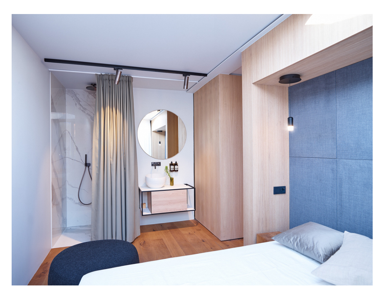
Bild: PM_Containerwerk_30.000 begeisterte Besucher – Containerwerk überzeugt auf der Milan Design Week 2018 \_ Bild 5