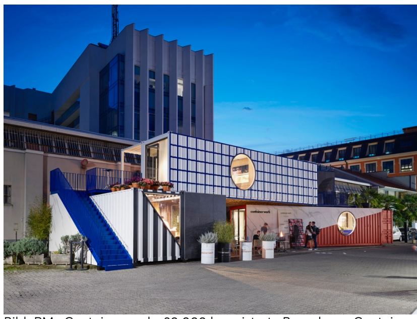
Bild: PM_Containerwerk_30.000 begeisterte Besucher – Containerwerk überzeugt auf der Milan Design Week 2018 _Bild 3

BU: Containerwerk & Friends installation